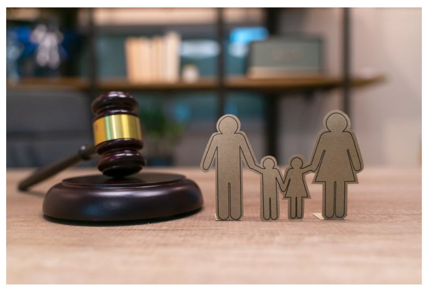
Laws in certain states allow agencies to discriminate against LGBTQ+ people during the adoption process.

times, LGBTQ+ couples wait for calls that never come, and they don't know why that's happening."