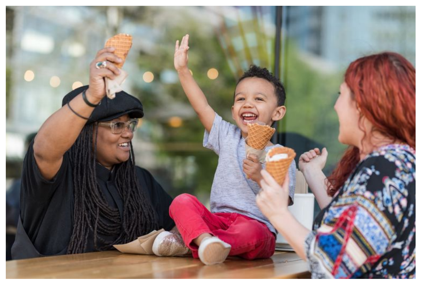
Research shows that same-sex couples can raise and adopt children in ways that are really positive.